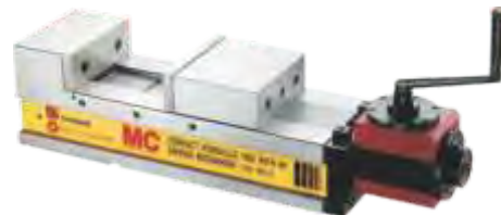
CHV-VD Model with 90° handle driving mechanism

Above vice is also available in one more model with 90° handle driving mechanism as shown below.